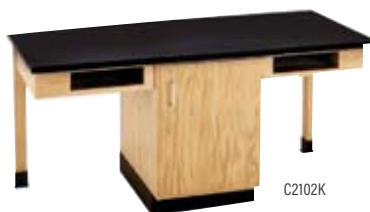
SINGLE FACE UNIT (66"W X 24"D X 30"H)