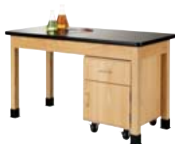
M19-2422-H30K (Shown w/30"H Table)