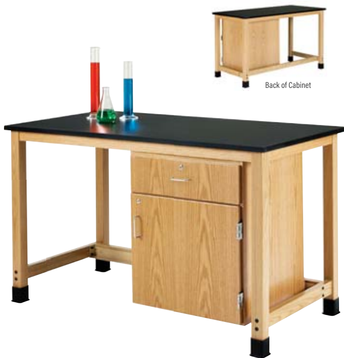
Back of Cabinet