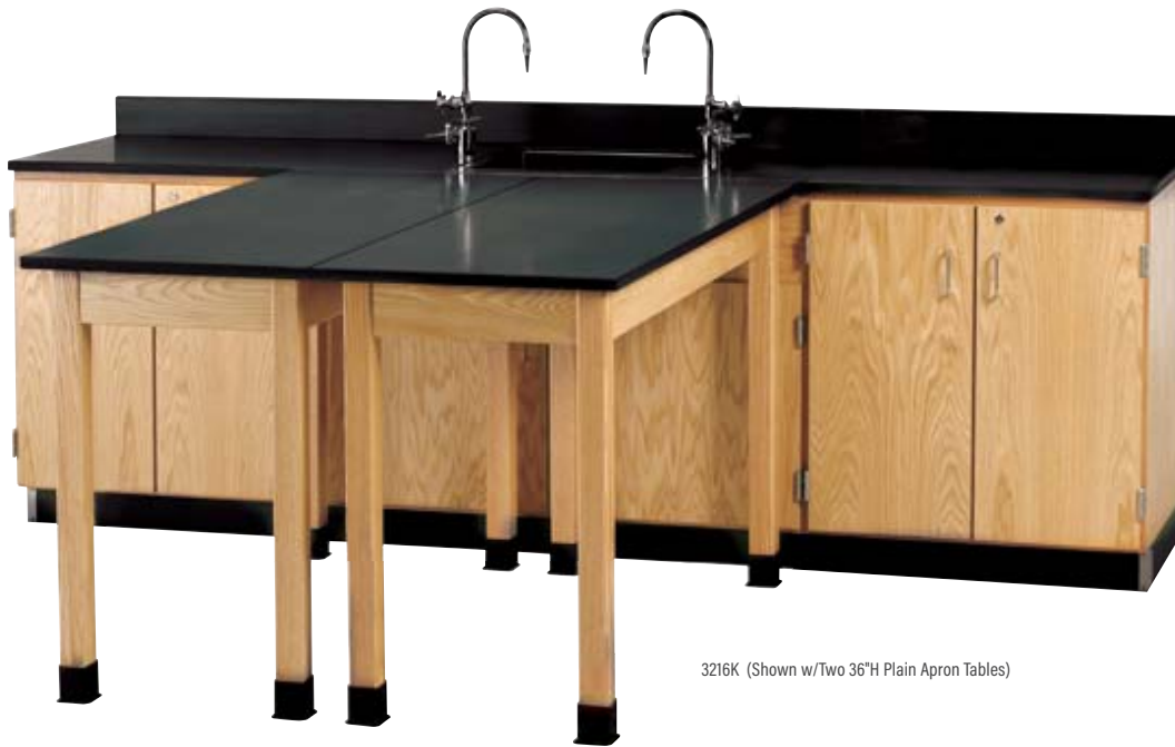
3216K (Shown w/Two 36"H Plain Apron Tables)