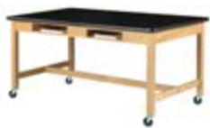
With Stretchers, Leg Braces & Casters