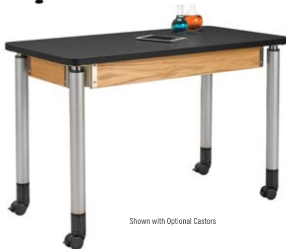
Shown with Optional Castors