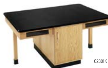
DOUBLE FACE UNIT (66"W X 42"D X 30"H)