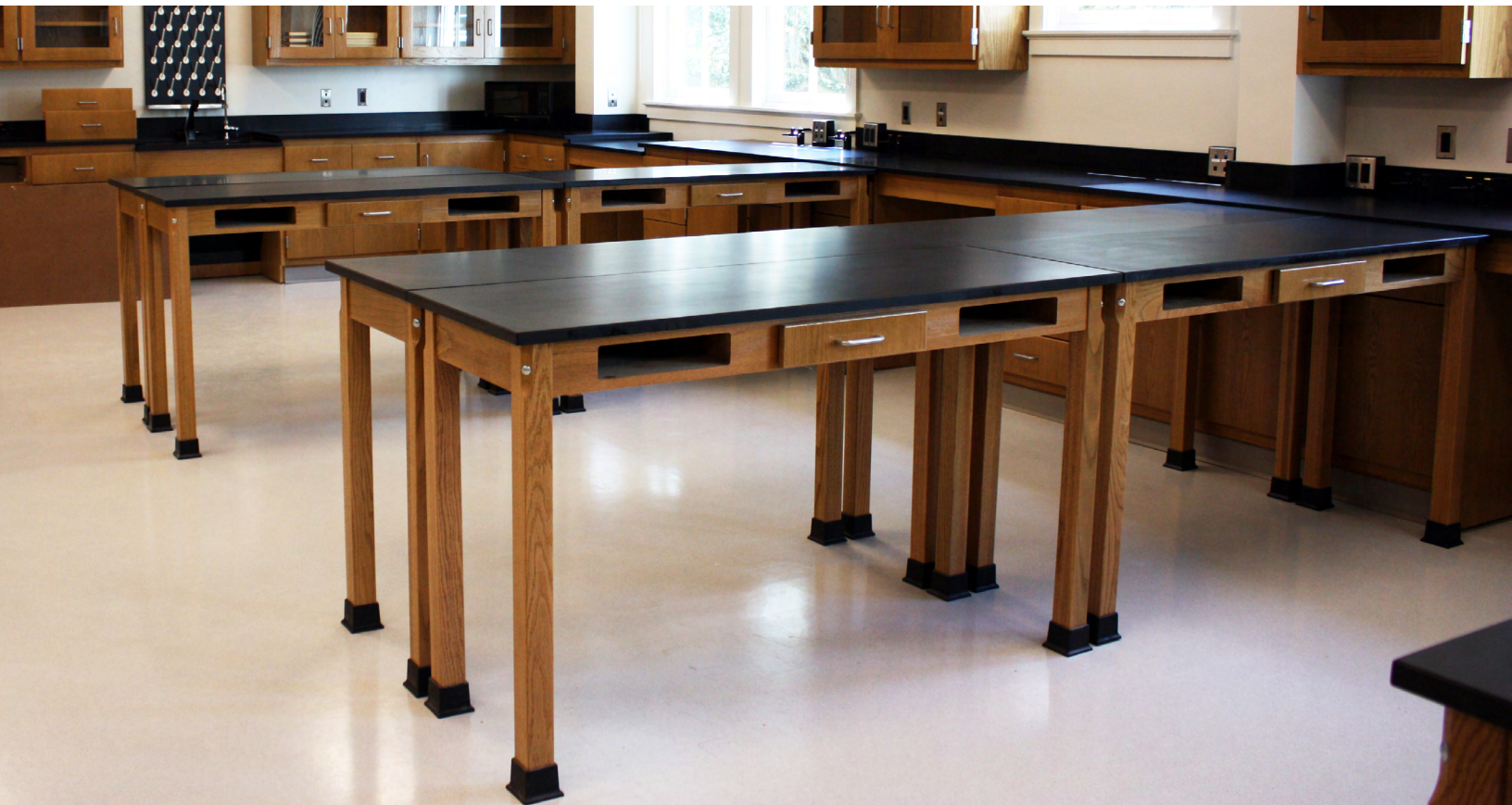
SHOWN Book Compartment Tables